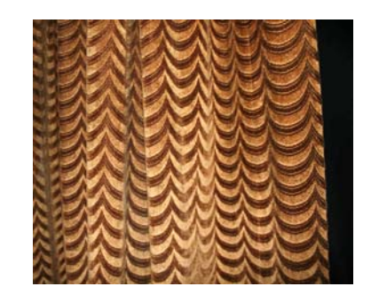
The main stage curtains are in wonderful condition. The cooler weather might have played a factor in preservation.

"Never doubt that a small group of thoughtful citizens can change the world; indeed, it is the only thing that ever has." - Margaret Mead